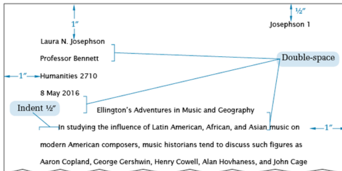
Fig. 1. The top of the first page of a research paper.

*Unless your teacher requests two. Also, no title page required, unless by teacher request.