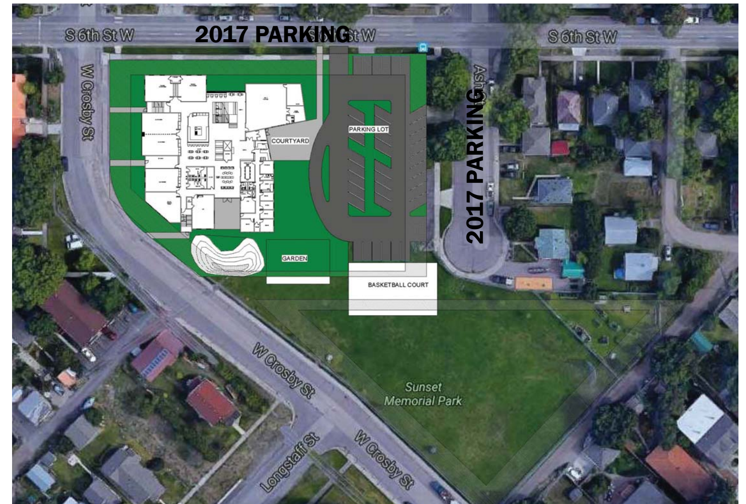
Overview of the new site plan once construction is complete in August 2018.

We want to reduce frustration over traffic and parking congestion for you and your student during the construction process. In the winter months, side streets around the school are not plowed frequently and this will cause even more parking challenges. Please consider starting the school year utilizing the bus to alleviate these frustrations and allow students to arrive at school on time and ready to learn.