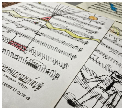
Ledge art created by the Native American Student Group at CS Porter.