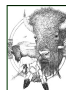
Artwork by Cecil B. Crawford

Facebook: www.facebook.com/MCPS Indian Education Department